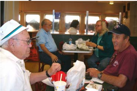
Caught up with the Prez - ED - KN6JN for lunch at Barstow Station Food for the trip home.