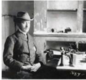
Marconi at Signal Hill in Newfoundland.