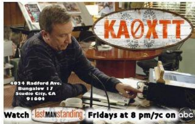
Fictional QSL card from ABC's prime time "Last Man Standing" TV series

KA0XTT -- prominently featured scenes with cast members using Amateur Radio. This episode will be the first episode to feature Amateur Radio since the middle of the show's first season .