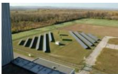
The solar array at the Zwentendorf Nuclear Power Plant.

The Zwentendorf Nuclear Power Plant was never run, owing to the outcome of a national referendum. Today, the plant produces electricity from some 2,300 photovoltaic panels, which can generate 450 kW peak.